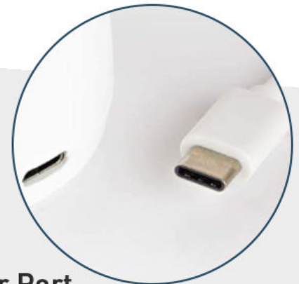
USB-C Power Port

4 Hours Fast Charge Can be Plugged in Reversely