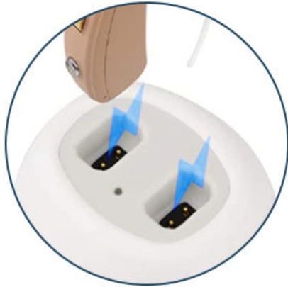
Magnetic Charging Dock