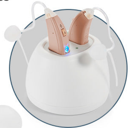
Can be Installed in Reverse